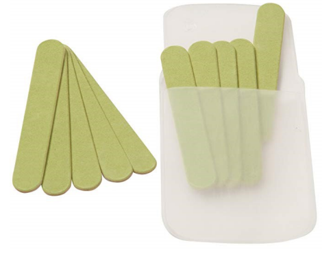
Safety 1st brand Easy Brush