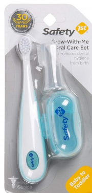
Safety 1st brand 3 piece oral care