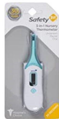
Safety 1st brand Nursery Thermometer