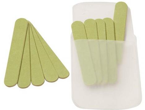
Safety 1st brand Emery Boards