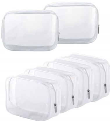
Portable waterproof clear cosmetic bag