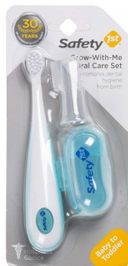
Safety 1st brand Easy Brush