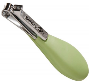
Safety 1st brand Hospitals Choice Clippers