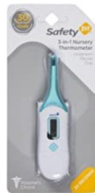
Safety 1st brand Nursery Thermometer