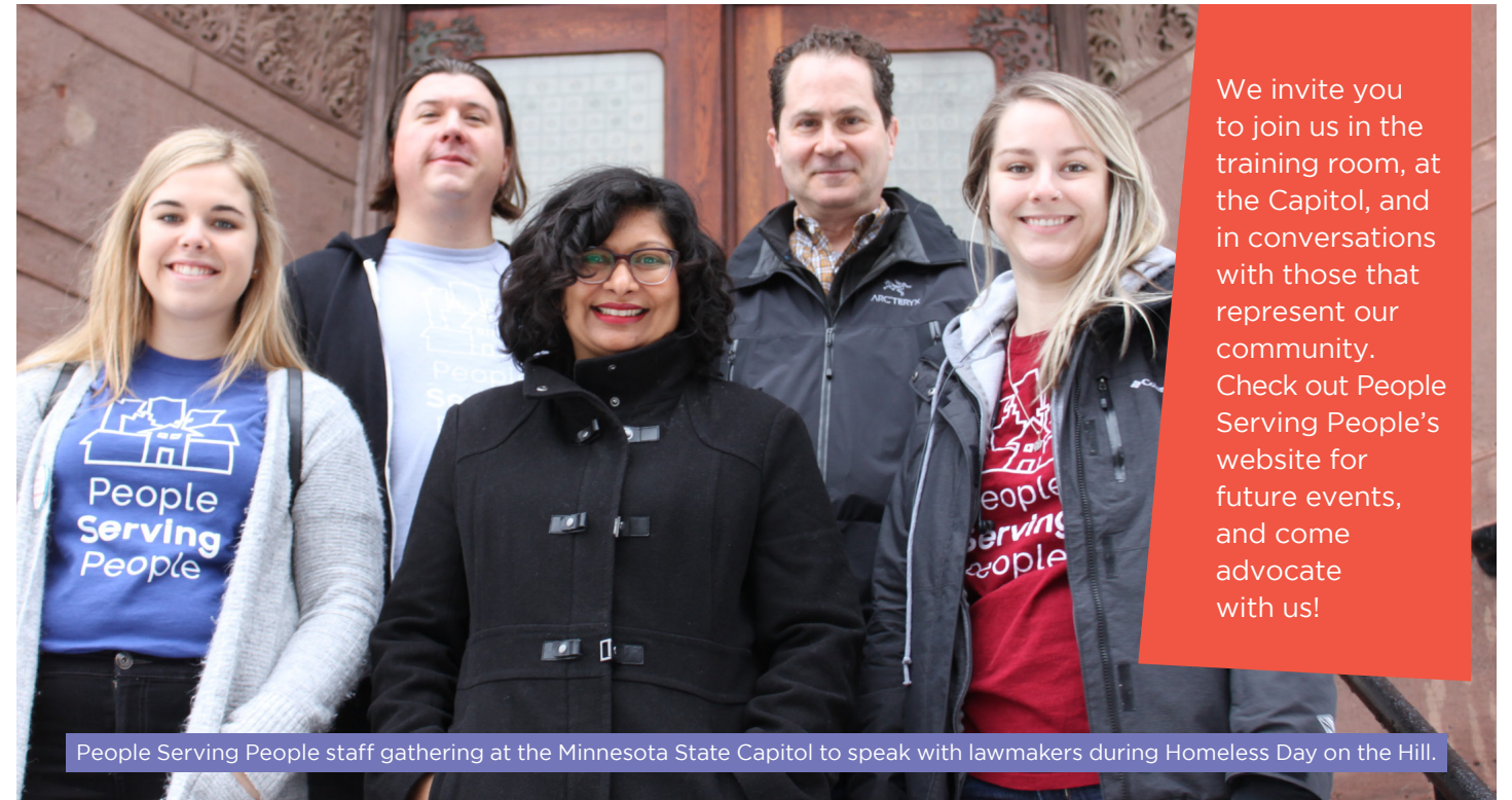
People Serving People staff gathering at the Minnesota State Capitol to speak with lawmakers during Homeless Day on the Hill.